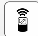
Remote control (optional)